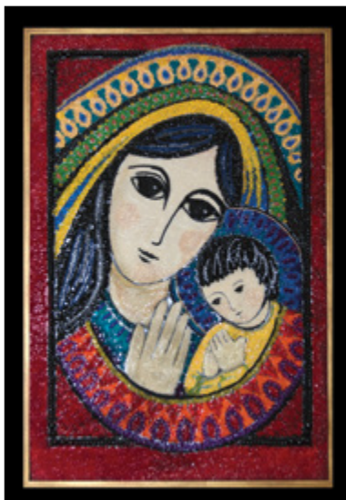
Award-winning art by an RHC resident